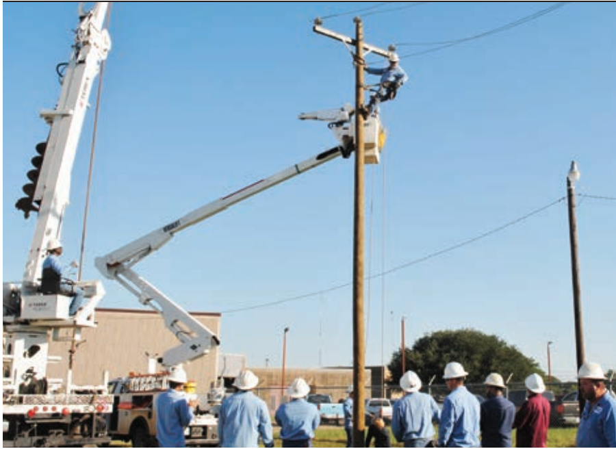
KELBY KOEHLERT HOUSTON COUNTY EC